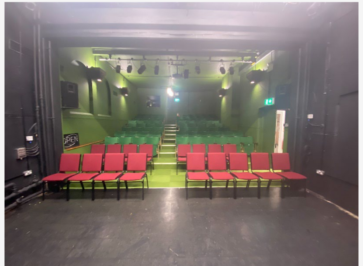
View from stage