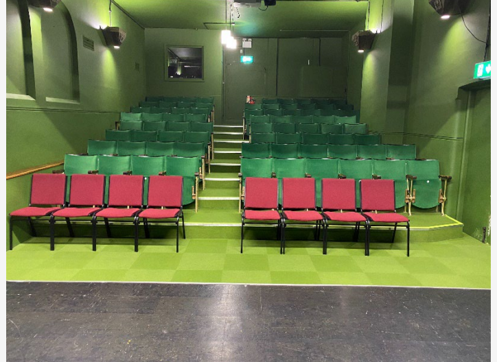
View from stage