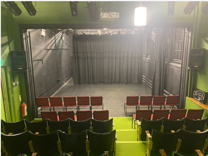
View from auditorium