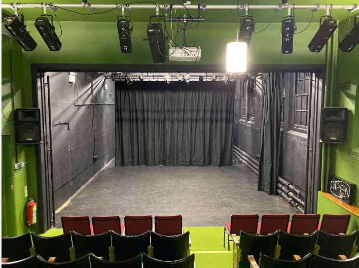
View from auditorium