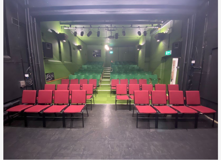
View from stage