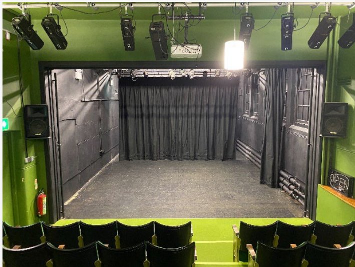
View from auditorium