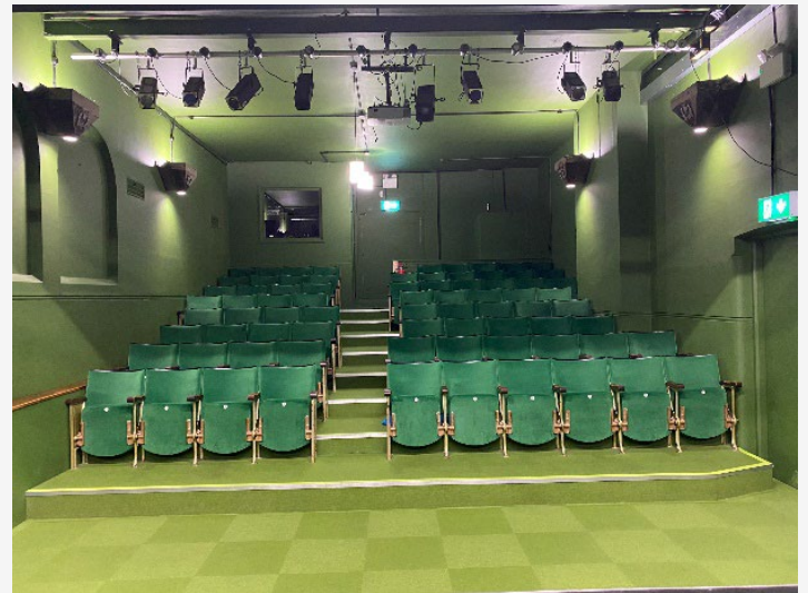
View from stage