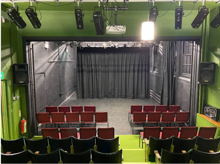
View from auditorium